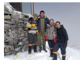
Team Galdhopiggen on the summit

If you would like to make a donation to the company please make all cheques payable to 8th Birmingham Boys Brigade and send them to the address on the front of this newsletter.