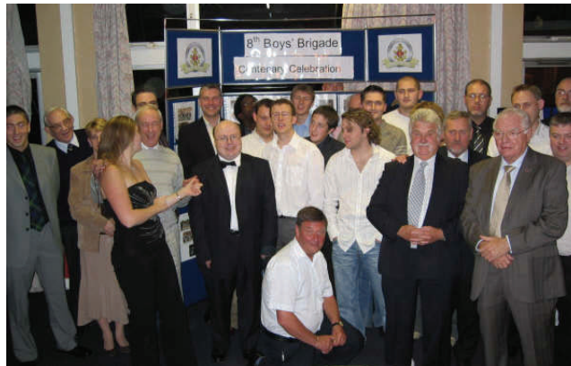
Members past and present at the Reunion, Norfolk Hotel, Birmingham 7th October 2006

The reunion saw the start of the centenary celebrations